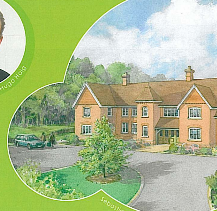
Sebastian's House artist's impression